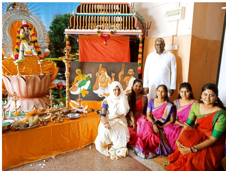
Thiruketheeswara Maka Kumpapishekam Isai kacheri Mannar.

The Thiruketheeswara Maka Kumpapishekam ceremony Celebrated on 07 th of June 2022.